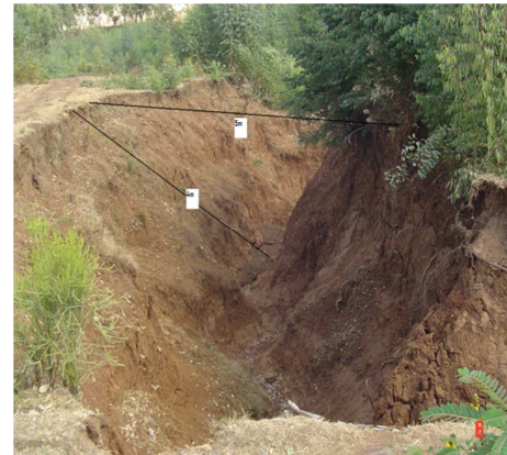
Figure 2. Gully formation on the foot of the mountain.

Changes in water flow are difficult to measure unless one uses an experimental mode of investigation. In the present case, however, indicators of decline or instability of water flows were seen in terms of the status of water flow in the water falls of the mountain and small streams having their head water on the mountain. A number of them, unlike in the past, do not flow during part of the year. The reduced water supplies are reflected in drinking water points (usually springs in the valley). The increased frequency of flash floods on the one hand and moisture stress for crops on the other hand indicate the increased instability of the moisture situation.